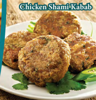
Chicken Shami Kabab