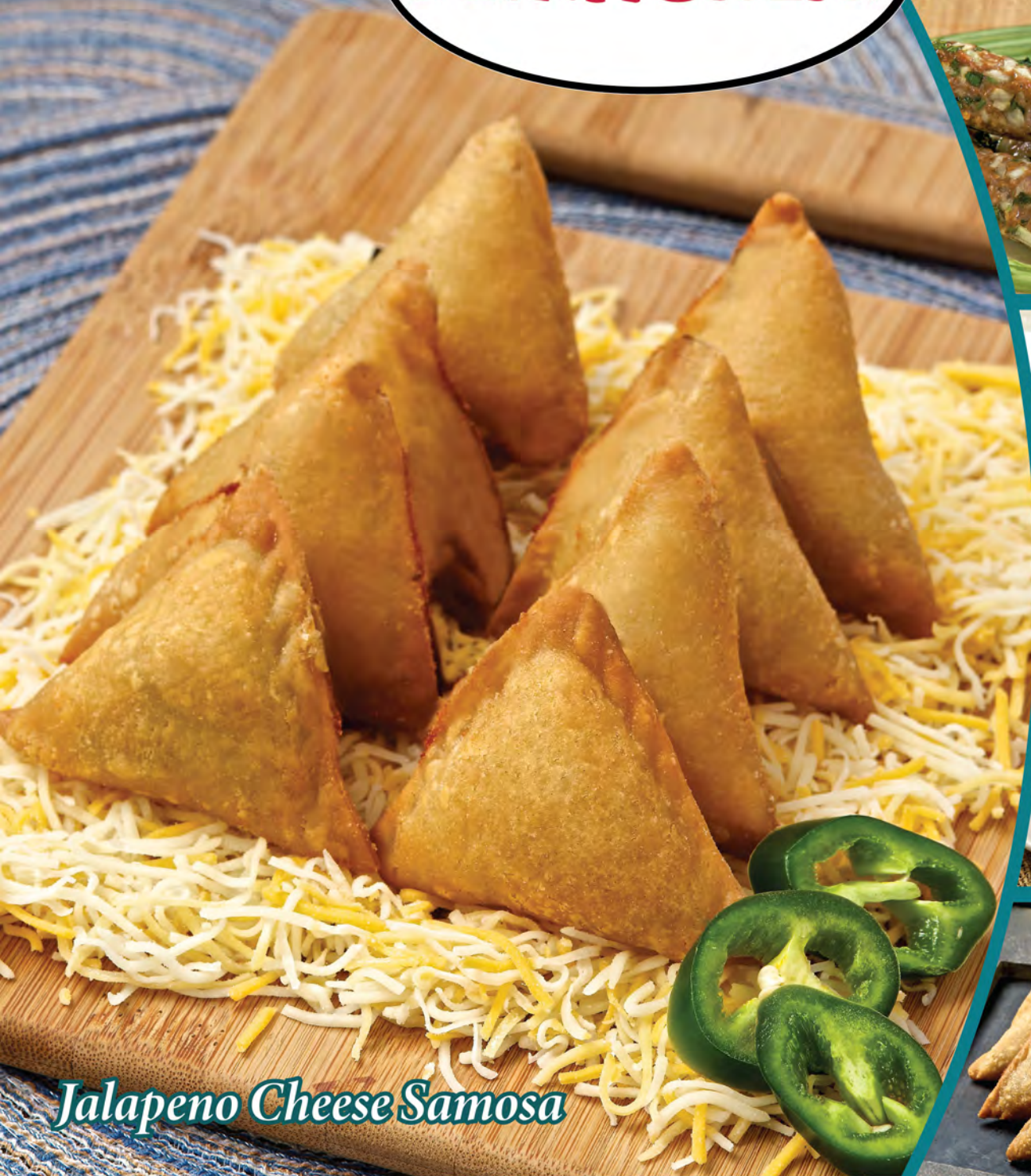
Jalapeno Cheese Samosa