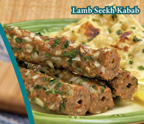
Lamb Seekh Kabab